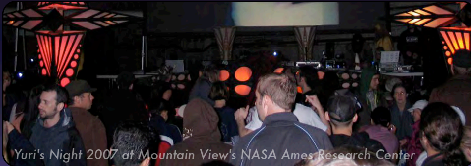
Yuri's Night 2007 at Mountain View's NASA Ames Research Center